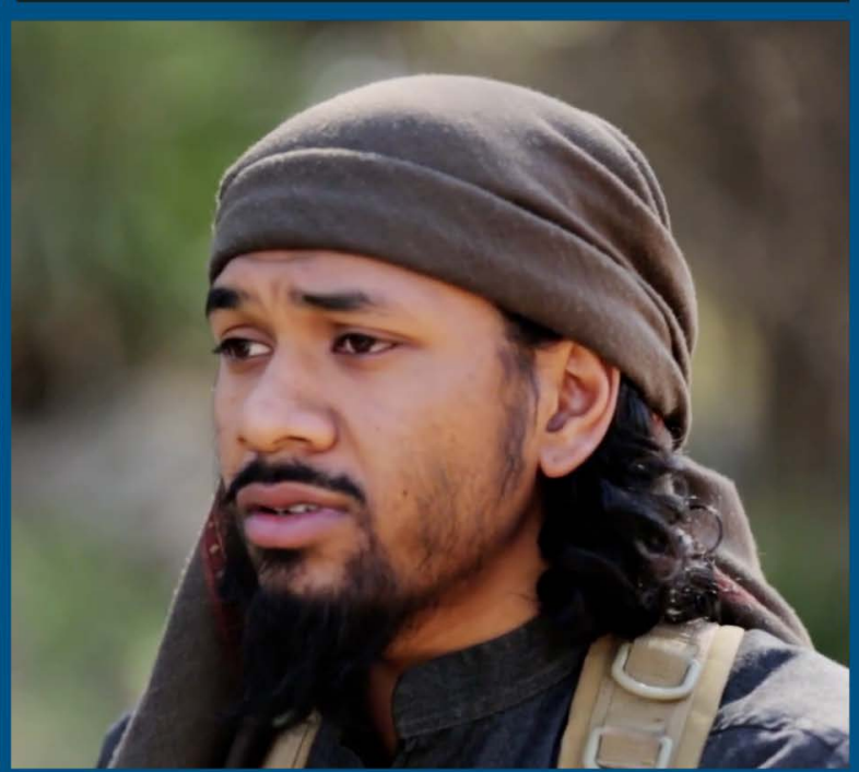
Figure 3: Prominent Australian Jihadist Influencers Jake Bilardi and Neil Prakash