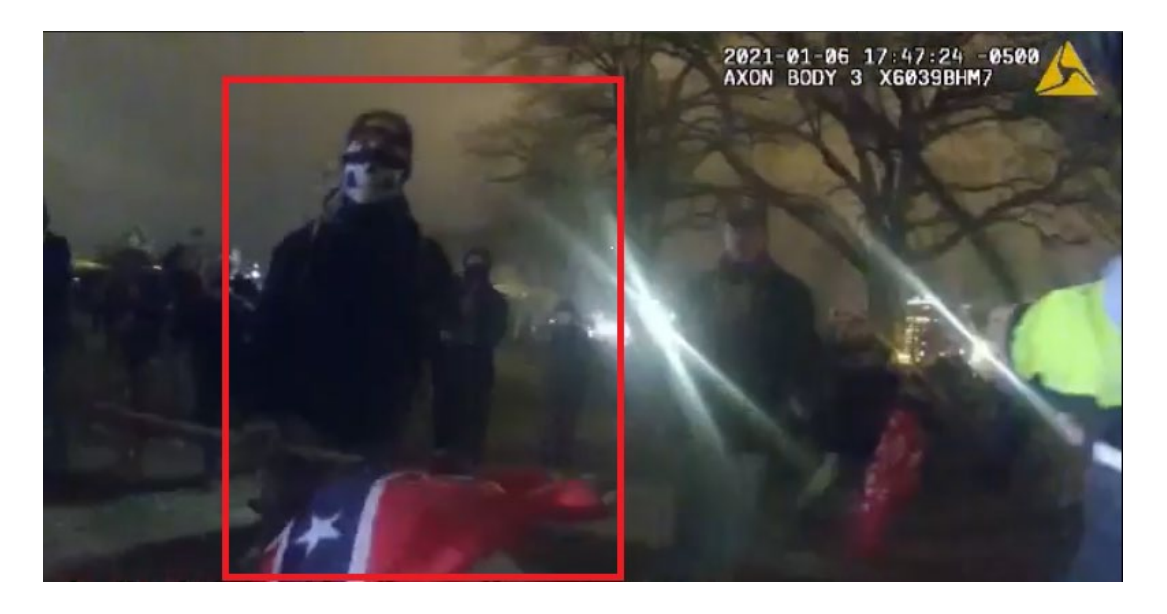
One second later, Blair raised the flagpole and pushed it into Officer K.P.'s chest: