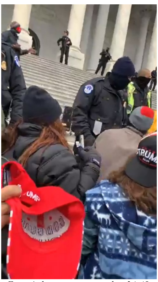
Exhibit 2D - Screenshot from Evans's livestream at marker 34:48, showing crowd at the base of the East Steps, blocked by Capitol Police, and a secondary line of police at the top of the steps holding rifles.

was about 10 feet away from the line, admonished others to "keep it peaceful." Officers with M4 rifles were visible at the top of the steps.