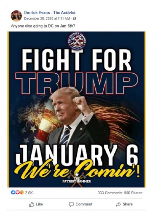
Exhibit 1A – December 26, 2020, post from Evans's public Facebook page promoting the January 6 rally. 2.8 thousand likes, 333 comments, and 900 shares.

an image of former President Trump including the words, "FIGHT FOR TRUMP" and "JANUARY 6, We're Comin'!" Evans included the caption, "Anyone else going to DC on Jan 6th?"