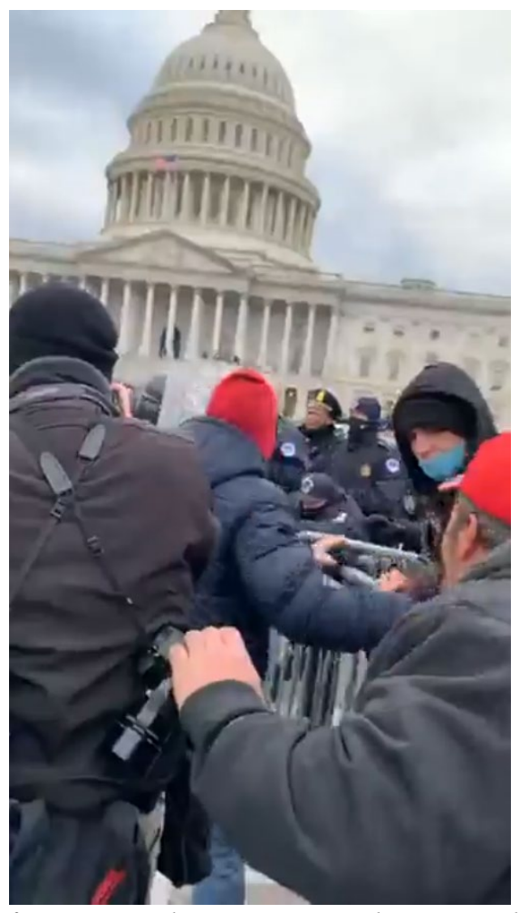
Exhibit 2A – Screenshot from Evans's livestream at marker 29:43, showing rioters grappling with police and bike racks

Starting at about 1:58 p.m., Evans's livestream video shows rioters grappling with the bike rack barriers, ultimately pulling them away from the police. Even without the barriers to protect themselves and the Capitol, Evans's video shows Capitol Police trying to hold their line and hold rioters back. As this was happening, Evans said, "For the record guys, I'm not touching anything I am just here to watch and film and support people and try to keep the peace, but peace is over with." After a breach of the barriers on the North end, rioters closer to the center of the Plaza (where Evans was standing) charged—then overwhelmed—police. Rioters can be seen flooding into the restricted area on the East Plaza of the Capitol, screaming and cheering as they went.