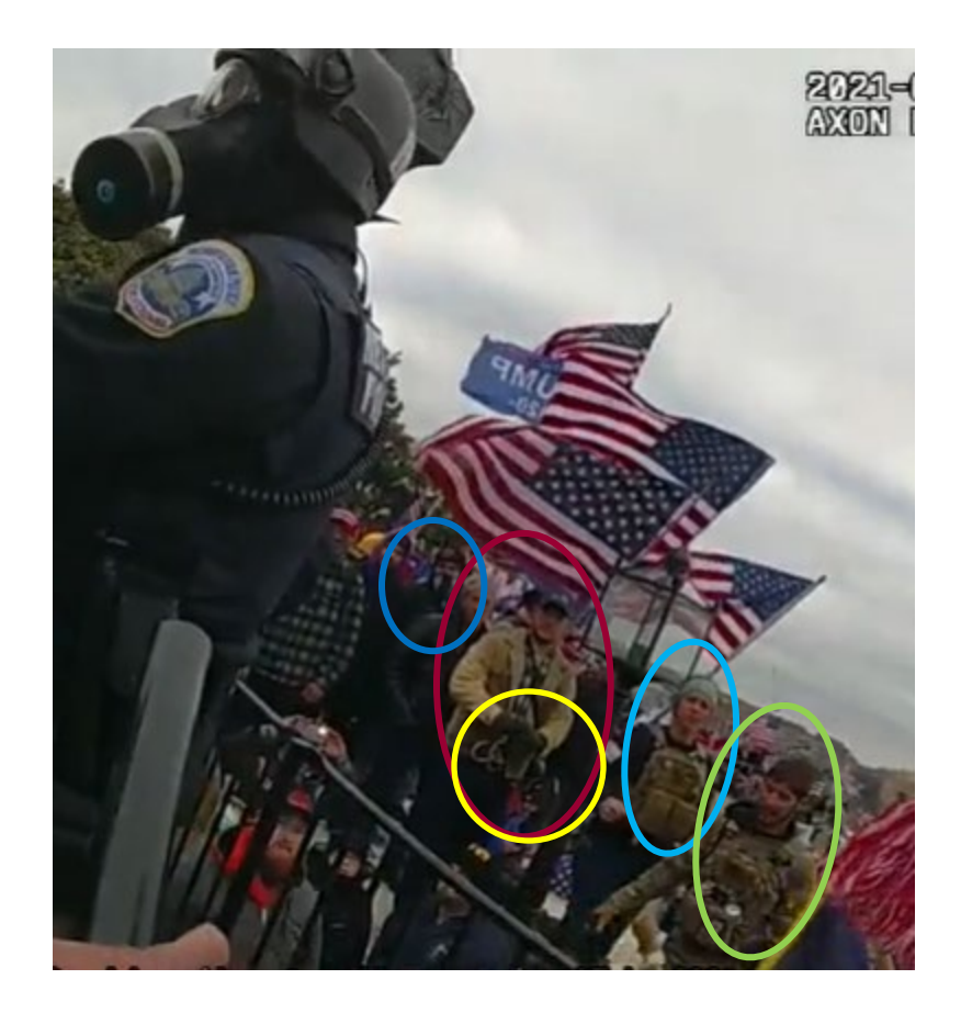
Government Exhibit 5.1