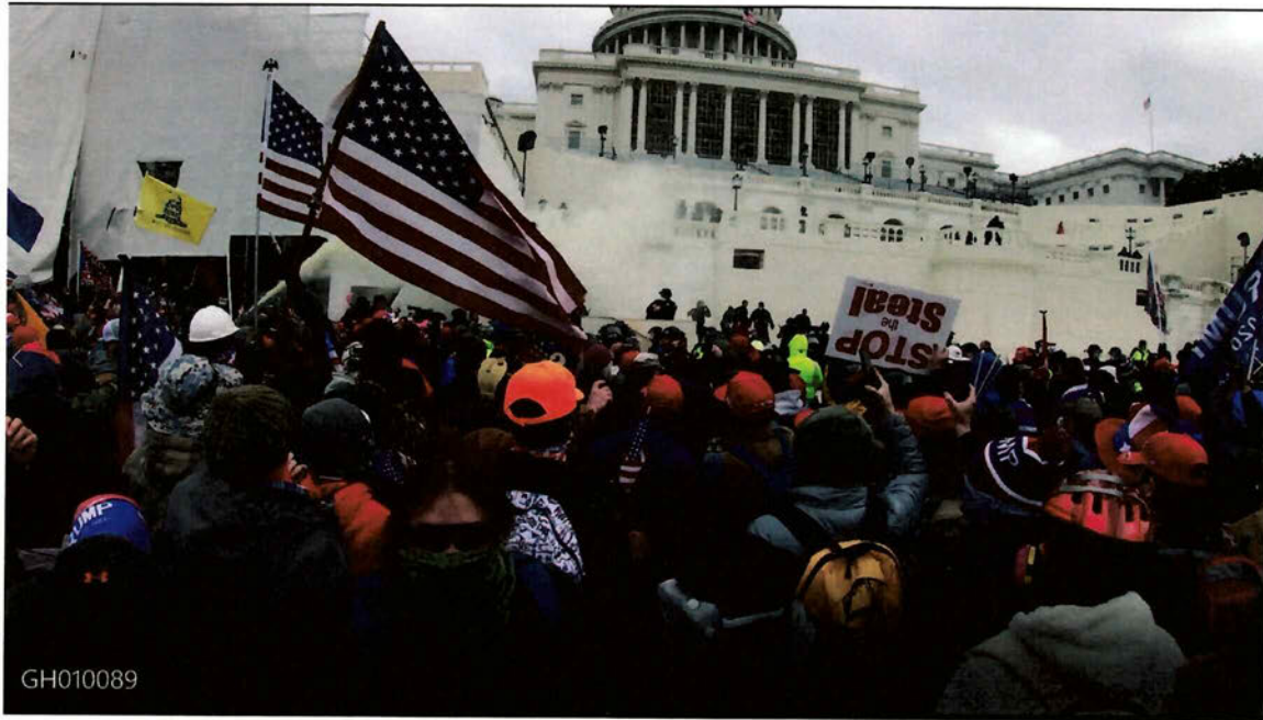
The following image is depicted later in the same GoPro video taken by CRUZ as he walked towards the U.S. Capitol building. A man is shown trying to break a window near the West Stair Doors: