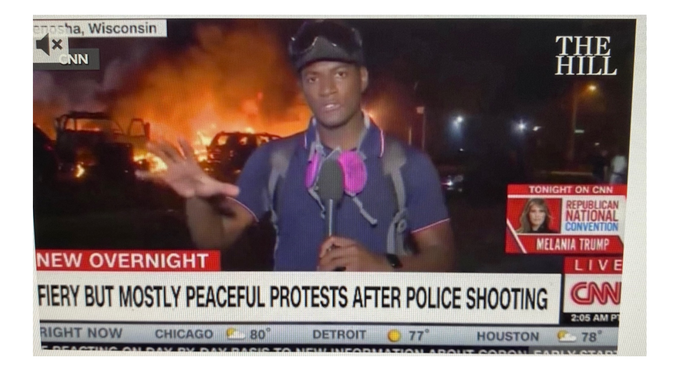
Image obtained from video clip at <a href="https://thehill.com/homenews/media/513902-cnn-ridiculed-for-fiery-but-mostly-peaceful-caption-with-video-of-burning">https://thehill.com/homenews/media/513902-cnn-ridiculed-for-fiery-but-mostly-peaceful-caption-with-video-of-burning</a>.