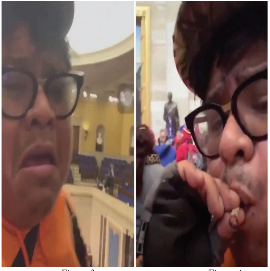
Figure 3 Figure 4

Your affiant has reviewed a copy of surveillance video footage obtained from an internal security camera covering a hallway in the U.S. Capitol Senate Gallery with a date and time stamp reading Wednesday, January 06, 2021, at 2:41:28 PM. This camera provides a view of a hallway and several sets of doors to rooms or areas out of the view of the camera. The beginning of the video clip showed several unidentified subjects in the hallway. A U.S. Capitol Police (USCP) officer (hereinafter referred to as "USCP1") is seen entering one of these sets of doors and is shortly joined by two other USCP officers ("USCP2" and "USCP3"). As part of their official duties, USCP1, USCP2, and USCP3 were clearing individuals out of rooms and securing the doors.