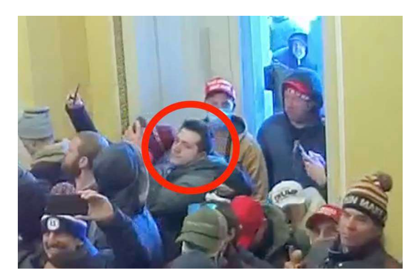
38. Affiant has compared the video taken by MOAT with Capitol CCTV videos and determined that MOAT's provided video was taken from vantage point of the person circled in red