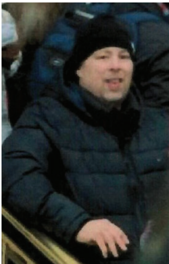
(Outside of the U.S. Capitol)