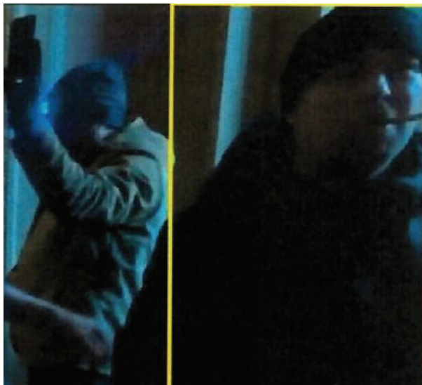
(Inside of the U.S. Capitol)