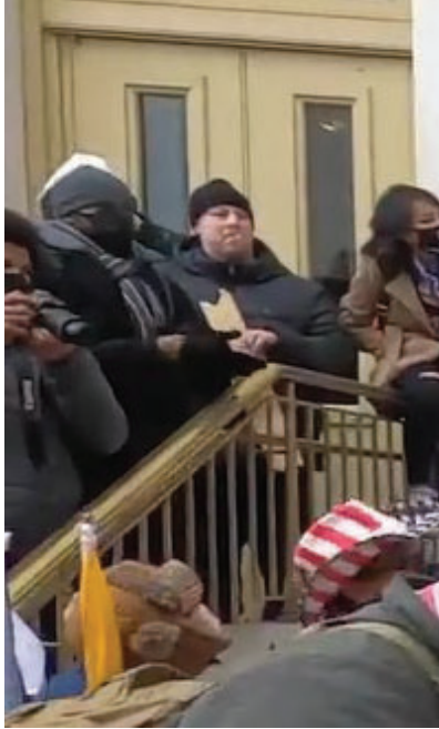
(Outside of the Parliamentarian Doors)