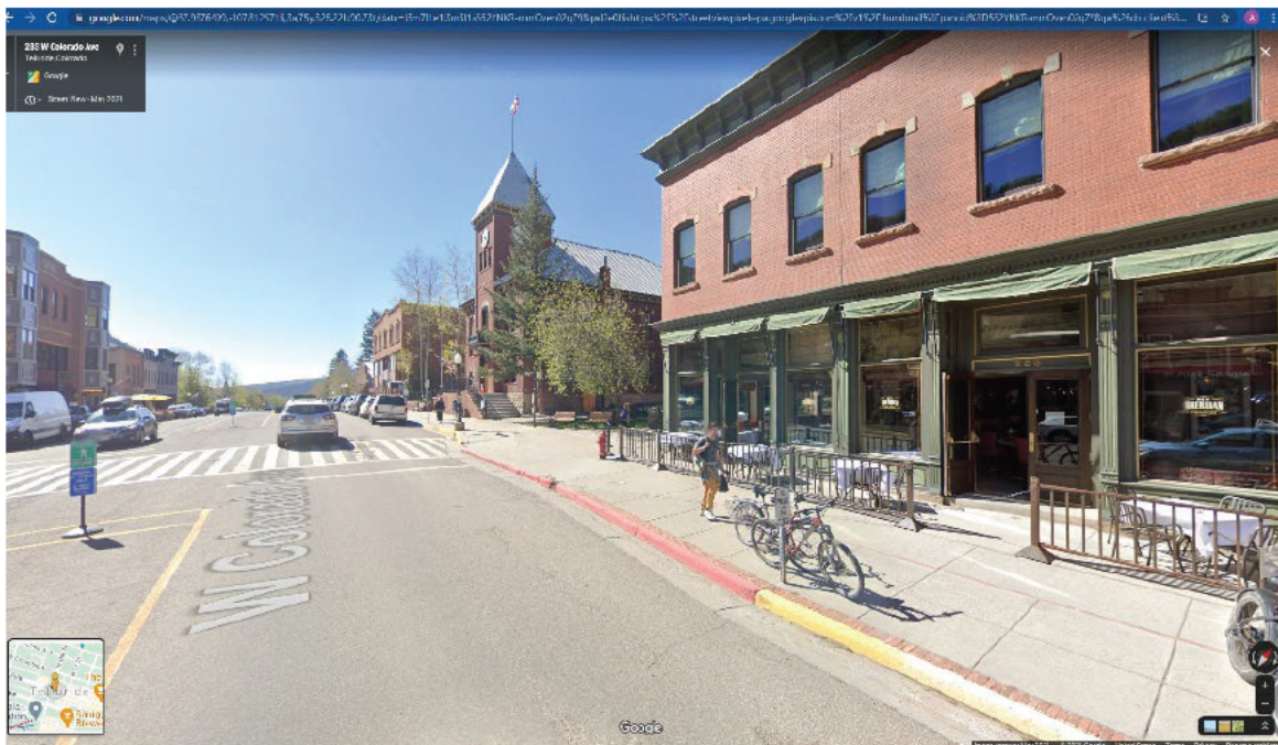
Photo 3 - Google maps - street view of Colorado Avenue in downtown Telluride, CO