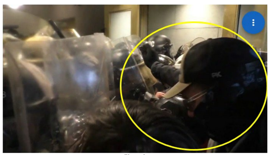
Figure 8 https://www.youtube.com/watch?v=cJOgGsC0G9U&feature=youtu.be&has_verified=1

From approximately 19:47 - 20:07 of the video, SIRR is seen pushing against the police line with his hand pressed against a police shield, as seen in Figure 8: