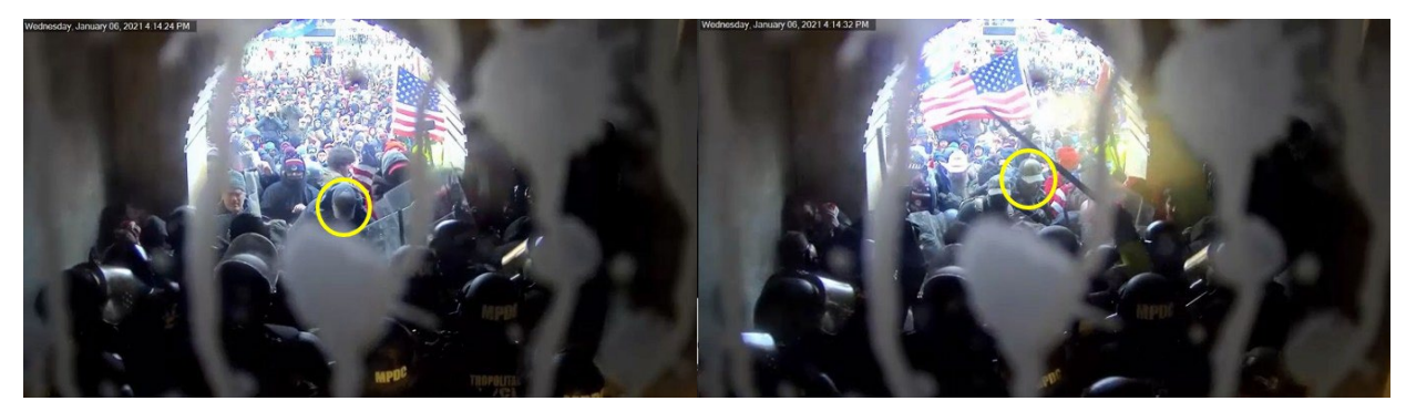
Figure 10 Figure 11

At approximately 3:14 p.m., surveillance footage captures SIRR exiting the Lower West Terrace tunnel. Approximately one hour later, at 4:14 p.m., USCP surveillance footage shows SIRR reappear at the Lower West Terrace doorway pushing other rioters who appear to be pushing against the police, as seen in Figures 10 and 11: