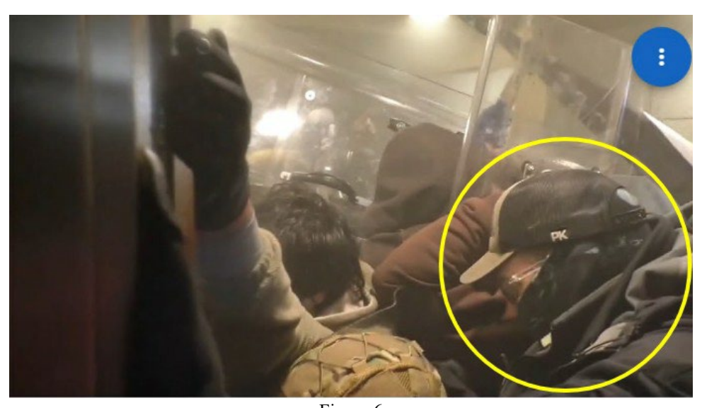
Figure 6 https://www.youtube.com/watch?v=cJOgGsC0G9U&feature=youtu.be&has_verified=1

Video footage posted to YouTube appears to directly correspond to the USCP surveillance footage, and shows SIRR's activities while at the front of the line of rioters inside the tunnel. During a video taken inside the tunnel from video mark 18:49 - 18:57, SIRR is at the front of the police line pushing against rioters who are assaulting police officers as seen in Figure 6: