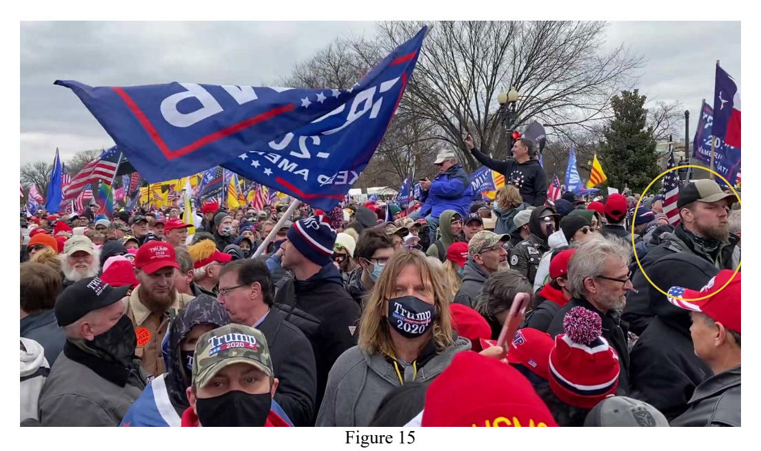
https://www.youtube.com/watch?v=zEPk1B11wtE&t=208 at video mark 3:27

Additional open source material captured SIRR with his glasses off and gaiter pulled down in both video and photographs taken before and during the riot: