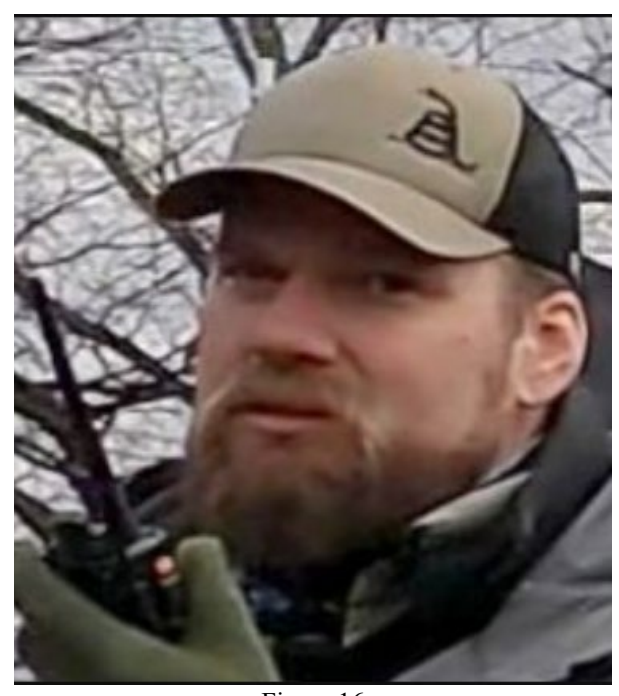
Figure 16 https://www.fbi.gov/wanted/capitol-violence-images/249-c.png/view

Following the January 6 attack, images of SIRR participating in the riot appeared on the internet. Based on the images, the FBI created a profile for SIRR as moniker "AFO-249." The FBI posted images of SIRR to its website and to social media, including the image in Figure 16, to garner public assistance in identifying SIRR.