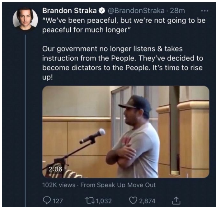
Gov. Figure C

https://twitter.com/speakupmoveout/status/1340274672768827394 (last viewed January 13, 2021). Straka’s post, which was viewed more than 100,000 times, included a message that it was time to “rise up!” Id.