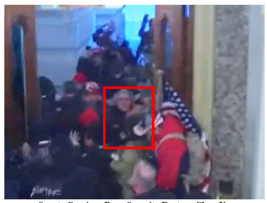
Senate Carriage Door Security Footage Close Up