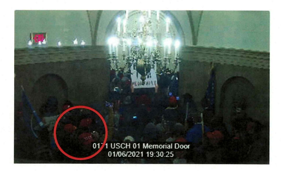
At approximately 2:32 PM, CCV captured persons believed to be KEVIN and DYLAN entering the Statuary Hall West area of the U.S. Capitol building.