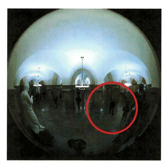
At approximately 2:38 PM, CCV captured a person believed to be KEVIN exiting the U.S. Capitol building through a broken window to the right of the Senate wing door.