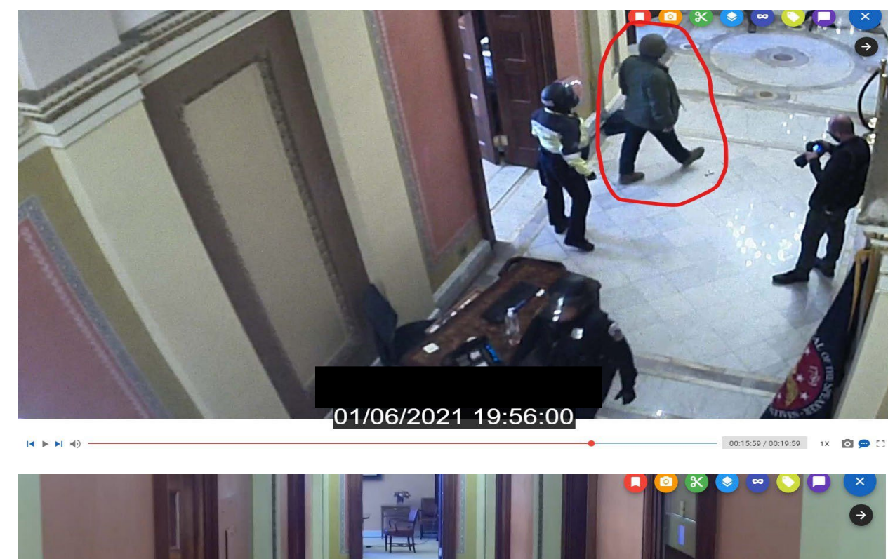
Figure 11 and 12

Barber had to be removed from the hallway adjacent to the Speaker's office not once but twice. The first time he exited (Figure 11) but then returned (Figure 12).