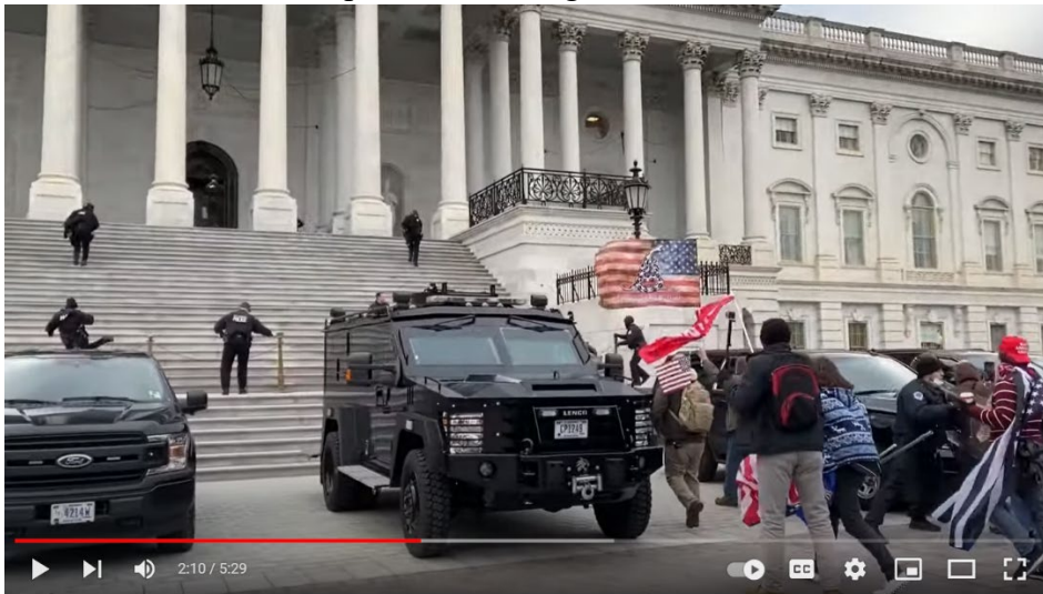
Patriots Storm U.S. Capitol in Washington, D.C.

Source: https://www.youtube.com/watch?v=uabDfDXY3yY “Patriots Storm U.S. Capitol in Washington, D.C.”