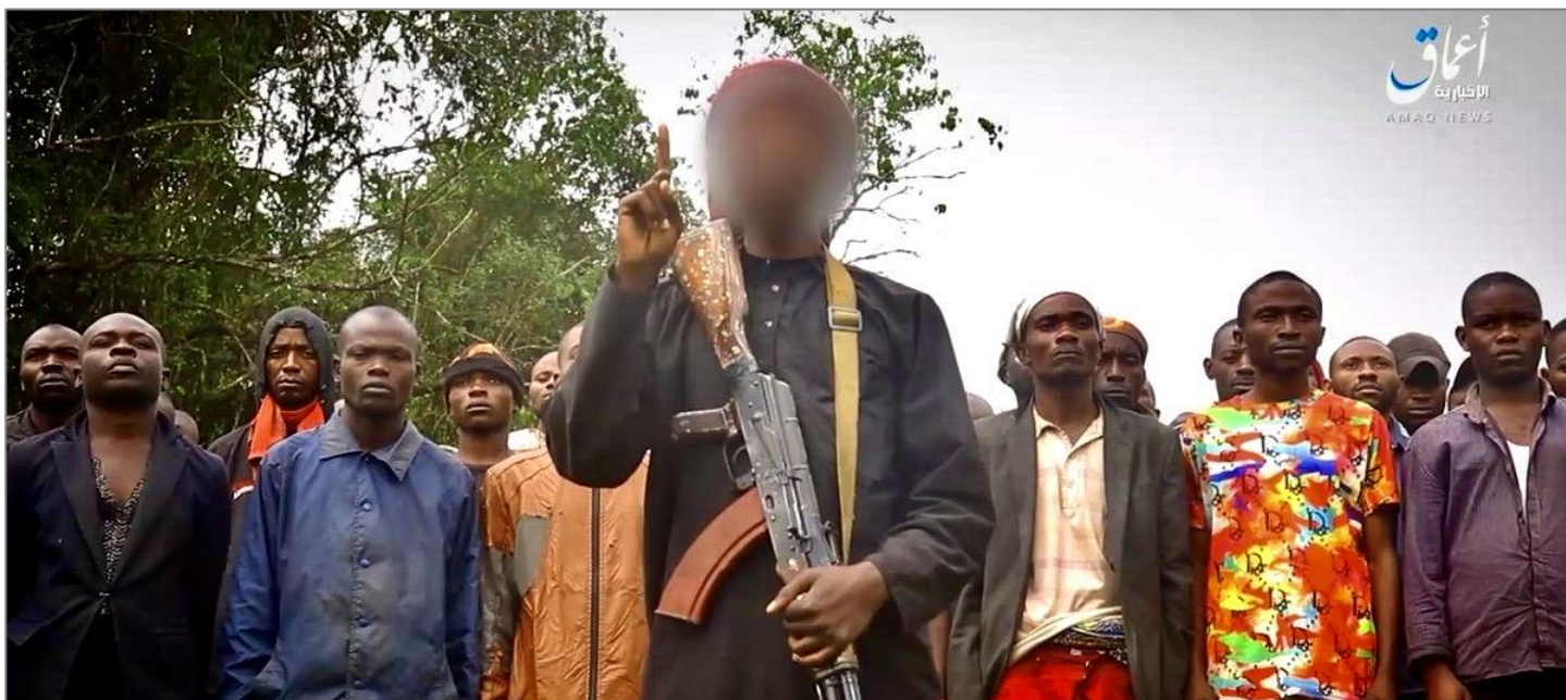
Figure 5: An ISIS-DRC fighter provides a speech following the Butembo prison break, which was released by the Islamic State's official Amaq News Agency channel.

These lines are eerily similar to an Islamic State Mozambique video released earlier in August. It is clear from the similarities that the Congolese affiliate likely abided by media guidelines ostensibly provided by the Islamic State to have common language in the videos. Other examples of ISIS-DRC likely abiding by these rules in its media includes the use of black kanzus [or thobes] to harken back to the Islamic State's reign of terror in Iraq and Syria, extreme hyper-violence such as graphic beheadings, and participation in global media campaigns such as the Islamic State's yearly Eid photo celebrations.