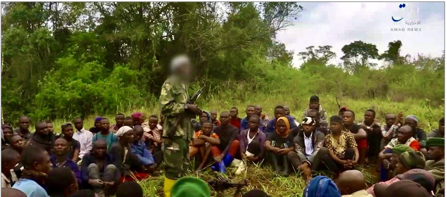
Figure 1: An ISIS-DRC commander speaks to freed inmates in a video released by the Islamic State's official Amaq News Agency channel.

https://extremism.gwu.edu/nexus-republishing-guidelines .