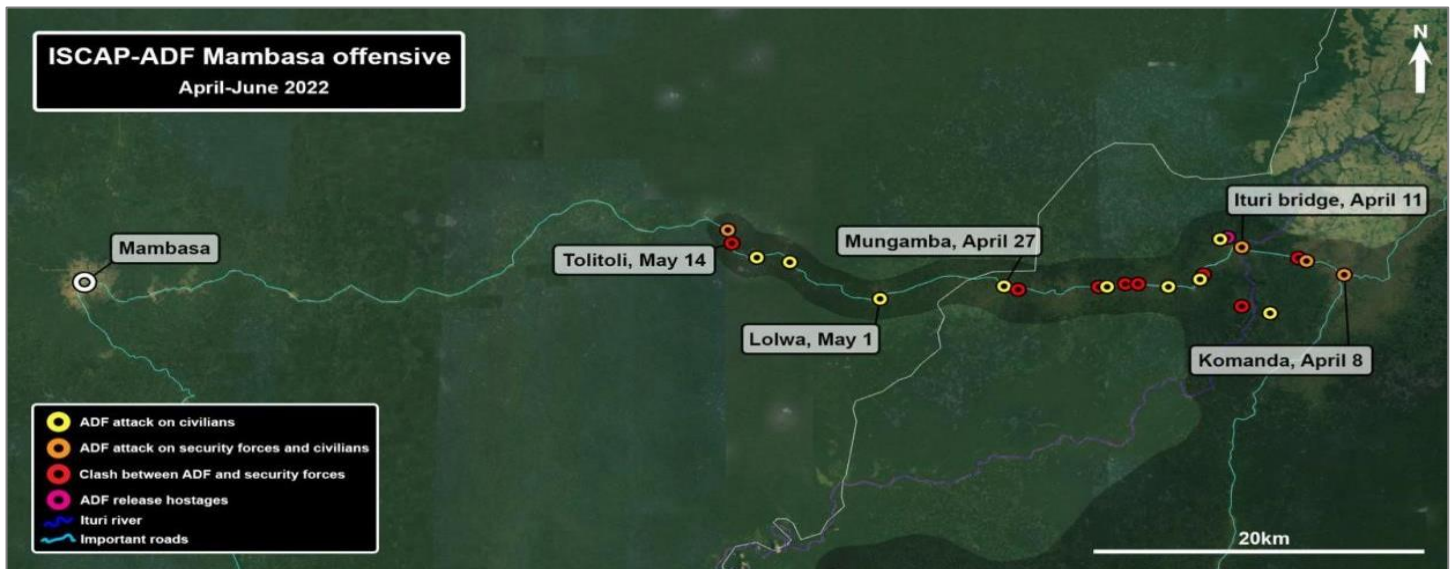
Figure 3: Beginning in early April, ISIS-DRC has pushed steadily west into Mambasa territory, entering areas far outside its normal area of operations.

Similarly, the last six months have also witnessed a territorial push on the southern limit of the group's traditional area of operations in Beni territory's Bashu region, though this expansion of attacks has covered less distance than ISIS-DRC's offensive into Mambasa. In November, the jihadist group mounted at least three attacks into Bashu, including an assault that killed 38 civilians in Kisunga, approximately 10km east of Butembo. In February of this year the group struck the farthest south it ever had, attacking the town of Karuruma and a nearby village three times between February and March. Four months later, on July 20, the Islamic State's Congolese wing assassinated Abdalatif Patanguli Kalemire , a 90-year-old customary chief and the patriarch of a prominent political family, and his wife in Bulambo, a town approximately 10km northeast of Butembo. The Islamic State's central media apparatus was quick to claim the attack, describing Patanguli as a former Armed Forces of the Democratic Republic of the Congo (FARDC) officer and making it clear they had targeted him.