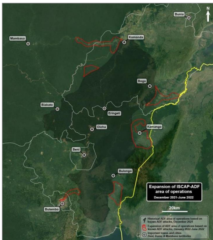
Figure 4: Since the beginning of the current military operations, ISIS-DRC has returned to some of its historic areas of operations while also pushing into new territories.

In addition to the group's expansion around its traditional area of operations, ISIS-DRC also perpetrated its first known attack in Goma, the provincial capital of North Kivu, which lies hundreds of kilometers south of its camps in Beni Territory. In April, the group conducted a suicide bombing on a military camp inside Goma , killing at least six people. While Congolese officials initially downplayed the attack and blamed it on an errant hand-grenade , later investigations have found the explosion was indeed the result of an improvised explosive device (IED) worn by a female suicide bomber .