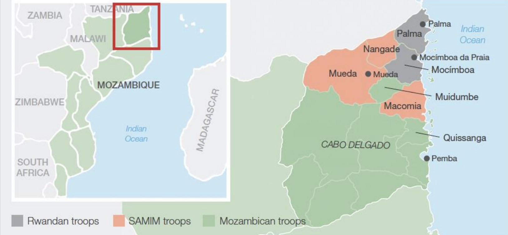
Image 2: Map of local and regional troop deployments

The joint offensive by government troops with Rwandan and SAMIM has recovered several districts from insurgent control, though their displacement prompted a new surge of attacks in neighboring districts. 15 SADC recently extended its mission, which was set to expire in April 2022, though reports suggest deep divisions within Mozambique over the Rwandan and SADC deployments. Overall, despite its notable successes, the tripartite counterinsurgency force continues to comprise an uneasy and relatively uncoordinated campaign. 16