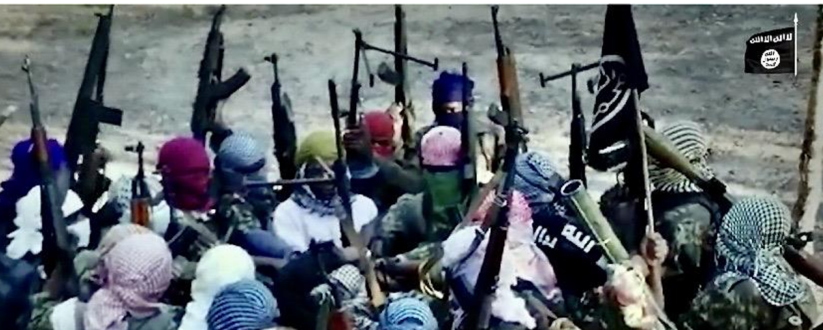
Image 1: A 2019 propaganda video released by the Islamic State showcases fighters in Mozambique pledging allegiance to the former caliph, Abu Bakr al-Baghdadi.