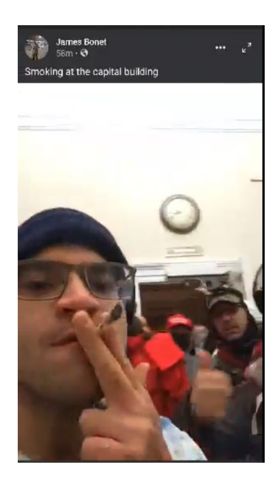
Figure 6 Figure 7

James Bonet was not the only rioter in Senator Merkley's office, nor was he even the only rioter who decided to light a joint in that spot.<sup>3</sup> Collectively, the rioters who invaded the office throughout the day—when it should have been a workspace for a Senator during the certification of the Electoral College vote—prompted Senator Merkley to post a video at 11:36 p.m. that night chronicling the damage to his office. The three-minute long video, available on Twitter at