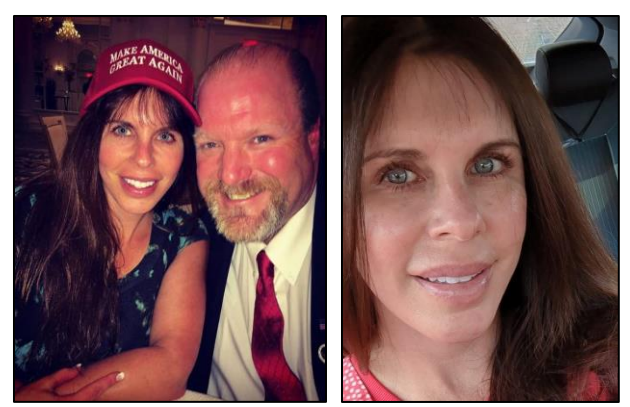
Figure 9 – Profile photos from Subject Facebook account

During their review of the Subject Facebook account, Agents identified the following relevant posts: