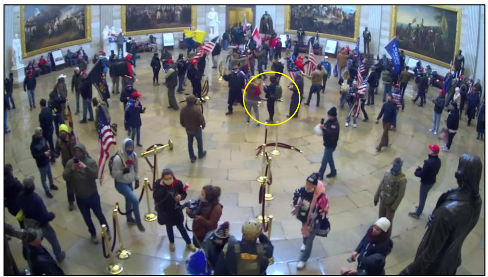
Figure 3 – USC CCTV at approximately 2:43 p.m.

Below are screen captures taken from the aforementioned video footage (the Subject Female is indicated in the yellow circle).