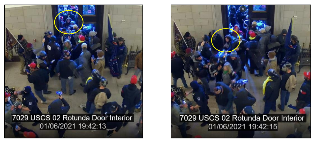
Figure 2 – USC CCTV at approximately 2:42 p.m.

Video footage obtained from the U.S. Capitol Police, shows a white female with long dark hair, wearing a dark-blue hooded sweatshirt with the phrase "Trump Girl" in white block lettering, and carrying an olive green backpack (the "Subject Female"), entering through the east front Rotunda doors to the U.S. Capitol at approximately 2:42 p.m. Below, depicted in Figure 2, are screen captures taken from the aforementioned video footage (the Subject Female is indicated in the yellow circle).