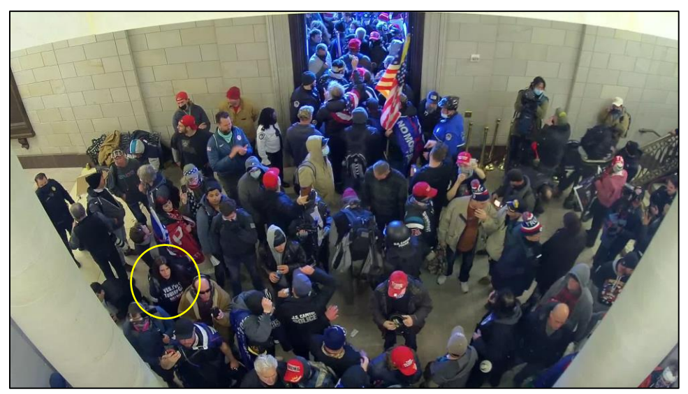
Figure 6 – USC CCTV at approximately 3:18 p.m.