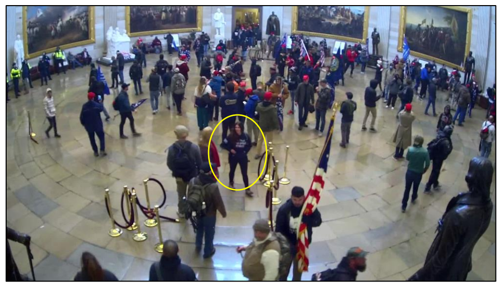
Figure 5 – USC CCTV at approximately 2:51 p.m.