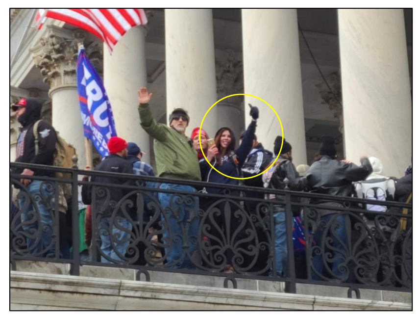
Figure 9 – Photo provided by FERGUSON

provided by FERGUSON (Figure 9 below - FERGUSON is circled in yellow), her physical appearance and clothing appears to match the Subject Female depicted in Figures 1-8.