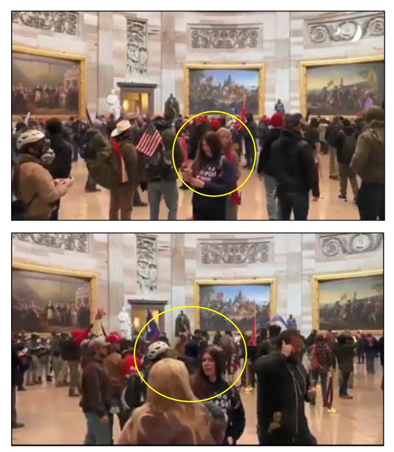
Figure 8 – AFP News Agency screen captures

Based on information provided by OSI, I reviewed video posted to Twitter by the Agence French-Presse (AFP) News Agency.<sup>1</sup> The video appears to show the Subject Female inside the Capitol Rotunda with a blonde female wearing a red scarf, also seen above in Figures 3-5. Below are screens captures from the AFP video (the Subject Female is circled in yellow).