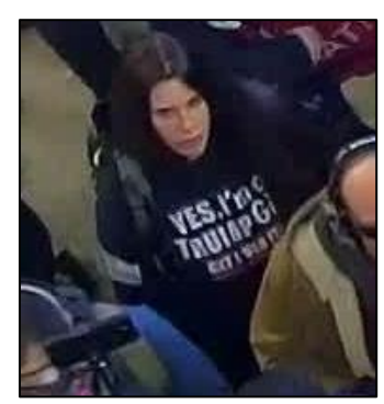
Figure 7 – USC CCTV at approximately 3:18 p.m. (close-up of Figure 6)