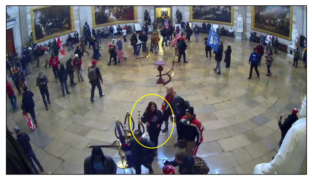
Figure 4 – USC CCTV at approximately 2:49 p.m.