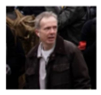
Photograph #294 - AFO J

In an effort to identify the man described above, the FBI released a "Be on the Lookout" (BOLO) photograph to the public, seeking information that might lead to his identification. Below is a photograph released by the FBI, in which the individual was labeled as BOLO 294: