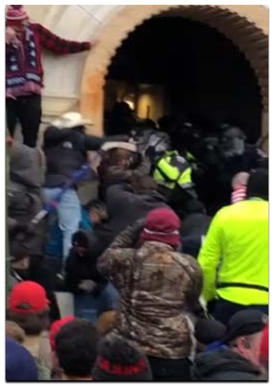
MELLIS Assault Image 3 (Striking / Stabbing at Officers with blunt weapon):