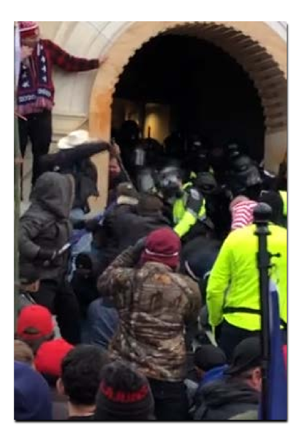
MELLIS Assault Image 3 (Striking / Stabbing at Officer's neck):