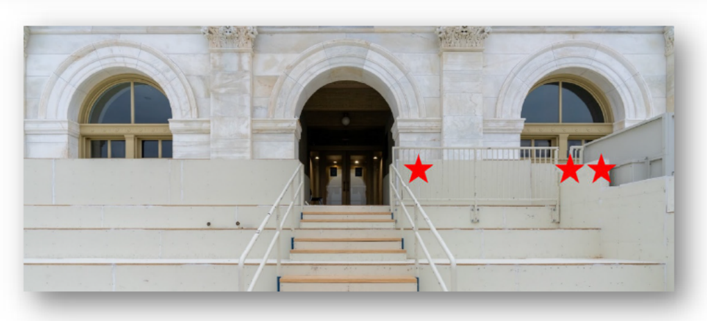
Figures 1 and 2—Two photographs showing (top) the Lower West Terrace of the Capitol and (bottom) a closeup of the Tunnel Entrance to the Capitol from the Lower West Terrace. As described below, MUNAFO struck a USCP officer twice and ripped a riot shield from the USCP officer's hands in front of the Tunnel Entrance (approximate location marked with a single red star), and damaged a window of the Capitol using a flagpole (approximate location marked with two red stars).