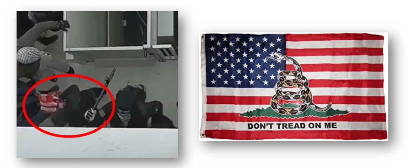
Figures 8 and 9—(left) a screenshot from open source videos showing MUNAFO (circled in red) receiving a flagpole with what appears to be a combination of the flag of the United States and what's known as the Gadsden flag, and (right) an image of the full version of the flag of the United States combined with the Gadsden flag.

At another point in time, MUNAFO was in front of the window of the Capitol marked with two red stars in Figure 2 above. An unidentified individual handed MUNAFO a wooden flagpole with a flag attached. The attached flag appears to be a combination of the flag of the United States and what's known as the Gadsden flag. MUNAFO struck a window of the Capitol several times in an apparent attempt to break the window.