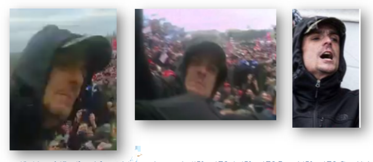
Figures 15, 16, and 17—(from left to right) three photographs (170 – AFO A, 170 – AFO B, and 170 – AFO C) published by the FBI while seeking the public's help in identifying suspect # 170.

On March 18, 2021, the Federal Bureau of Investigation (FBI) released videos of assaults on officers at the Capitol as part of an effort to seek the public's help identifying suspects.<sup>1</sup> The FBI identified suspect # 170 – AFO as one of the top ten most wanted Capitol Violence suspects for his assault on a federal officer (AFO). The FBI included three photographs with its BOLO.