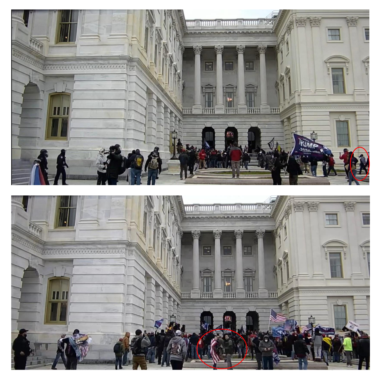
The U.S. Capitol was first breached in this area at approximately 2:13 p.m. when a rioter smashed out a window adjacent to the Senate Wing door with a riot shield and a rioter jumped through it over broken glass.