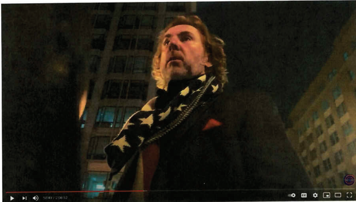
WASHINGTON Lots of cops downtown Washington DC 695 views • Streamed live on Jan 5, 2021