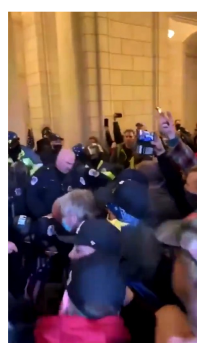
Simon moving closer to the officers attempting to remove individuals from inside the U.S. Capitol