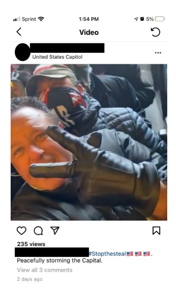
The Charges and Plea Agreement

post, the images and video had previously been posted on the Facebook page for Individual 1 but had since been deleted. Investigators were later able to locate the video and confirm it was posted to Individual 1's Facebook page with the caption, "Peacefully Storming the Capitol...#StopTheSteal."