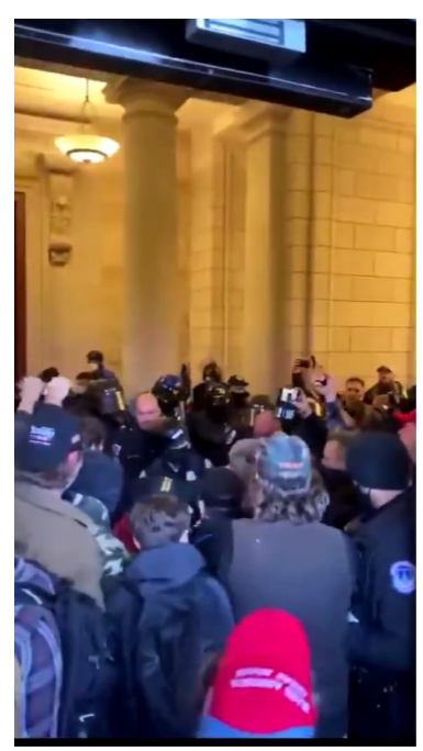
Simon capturing officers in the crowd in front of him