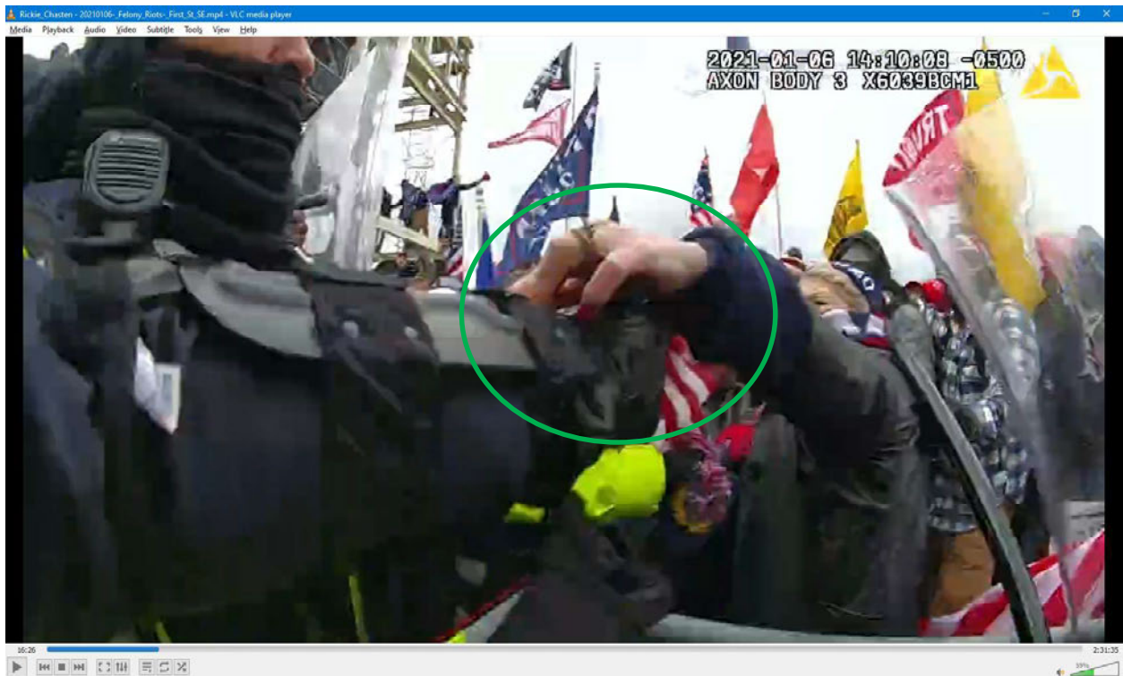
MMIDDLETON and JMIDDLETON continue grappling with and striking T.T. and R.C. as various flags are jabbed toward the officers' faces.