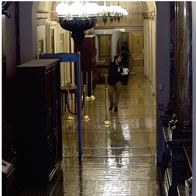
Gallery West Approximately 2:25pm Individual matching the description of VUKICH securing paperwork that he appears to have picked up from inside the U.S. Capitol.