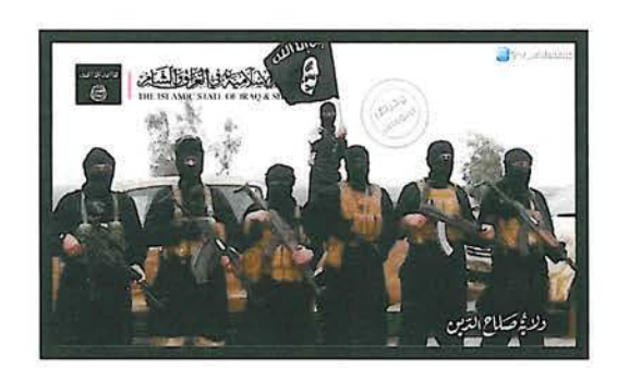
Figure 3: Image obtained from NAGI's Twitter account appearing to show ISIL fighters