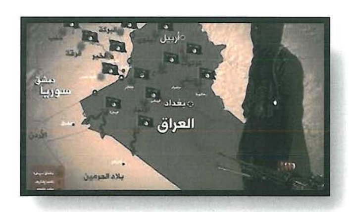
Figure 9: Cached image captured on NAGI's iPad on 07/30/2014, depicting a map of Middle Eastern countries/cities, marked with ISIL flags

47. Concurrent with these searches, NAGI also appears to have researched the Turkish National Intelligence Organization. Your Affiant notes (and further elaborates in later paragraphs) that upon NAGI's return to the United States, he engaged in a