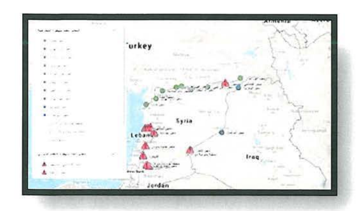
Figure 8: Cached image captured on NAGI's iPad on 07/30/2014, depicting crossings under opposition control (green circle) and crossings under Syrian regime control (red triangle)

46. Additionally, review of NAGI's web history also revealed several maps which appear to show ISIL controlled border crossings and strongholds.