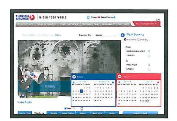
Figure 6: Search history image captured on NAGI's iPad on 07/31/2014, Turkish Airlines search for flights to Hatay Airport

42. NAGI also appeared to have searched on the iPad for flights from Istanbul to Hatay Airport as well as bus schedules and travel information to Hatay Province<sup>9</sup>.