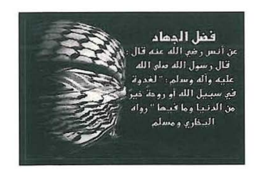
Figure 7: Cached image captured on NAGI's iPad on 07/31/2014, containing text that extols the virtues of jihad.

45. Further review of the search history in NAGI's iPad during the same time NAGI was researching travel to Iskenderun/Hatay also revealed searches and viewing of ISIL associated images and content.