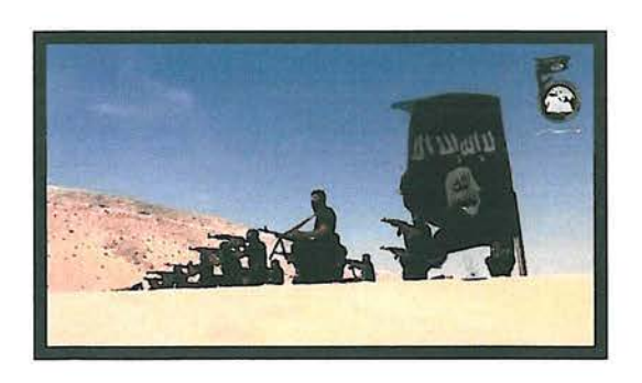
Figure 1: Image obtained from NAGI's Twitter account appearing to show ISIL affiliated fighters

23. As of September 12, 2014, the Twitter handle @farooq_quhaif had 412 followers. Additionally, @farooq_quhaif followed 278 unique Twitter handles. Of these handles (both followed by and following NAGI), there are approximately 124 common handles (i.e., handles that are both following and followed by the same handle). A review of the 278 Twitter handles that NAGI followed found approximately 140 that featured profile pictures of ISIL flags, photos of al-Baghdadi or Osama bin Laden, photos of weapons or of individuals in military fatigues, photos of recent beheadings, or other images which could reasonably be described as violent or terrorism-related in nature. Of the 412 Twitter handles following NAGI, approximately 187 of them showed images that could reasonably be described as violent or terrorism-related in nature. Examples further depicting the nature of NAGI's support of ISIL, to include images contained in NAGI's tweets: