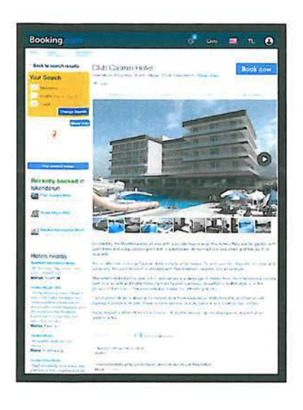
Figure 5: Search history image captured on NAGI's iPad on 08/03/2014, Booking.com search for hotels in Iskenderun

42. NAGI also appeared to have searched on the iPad for flights from Istanbul to Hatay Airport as well as bus schedules and travel information to Hatay Province<sup>9</sup>.