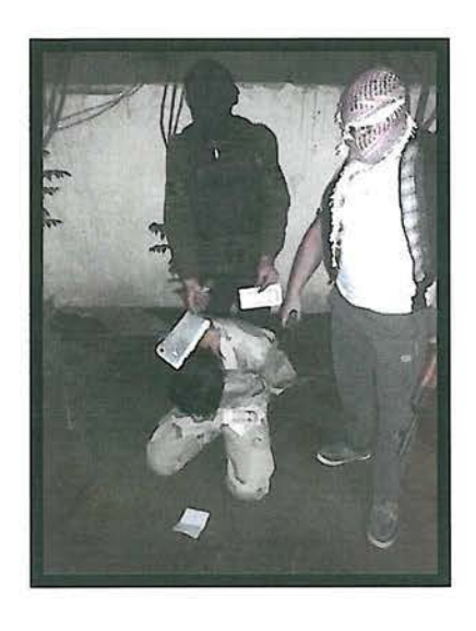
Figure 4: Image obtained from NAGI's Twitter account showing an individual about to be executed

Denying soldier, be killed by bullets or by knife; and they say that the State does not have freedom of choice." Again, your Affiant notes that the "State" is believed to refer to the Islamic State (i.e., ISIL).