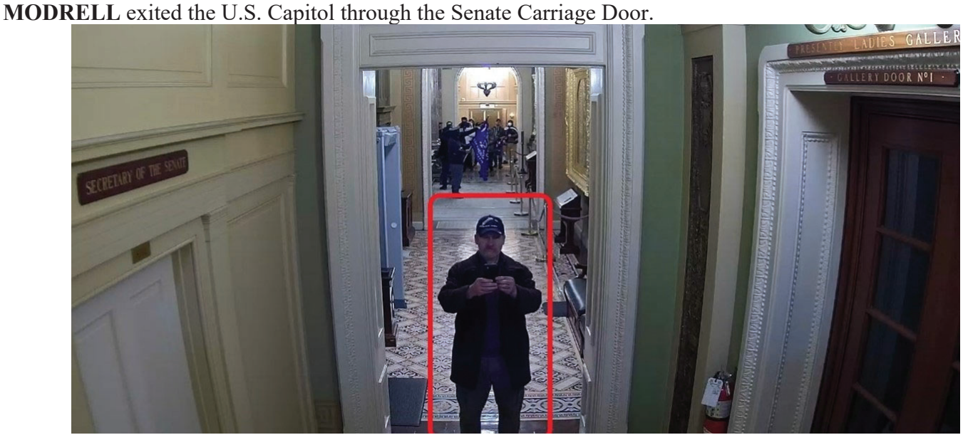
MODRELL within the Capitol

On March 30, 2022, the FBI reviewed Capitol CCTV footage depicting MODRELL within the Capitol building for approximately 25 minutes. At approximately 2:26 p.m. MODRELL entered the U.S. Capitol building through the broken Senate Wing window and proceeded to the Crypt. MODRELL made his way to the second floor, through the small House Rotunda, and by 2:36 p.m., entered the Grand Rotunda before taking the Grand Rotunda stairs to the third floor. On the third floor, MODRELL walked around the East Corridor and Senate Gallery appearing to film and photograph on his cell phone. At approximately 2:51 p.m.,