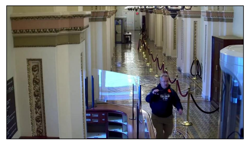
Figure 5 – USC CCTV (approximately 2:33 p.m.)