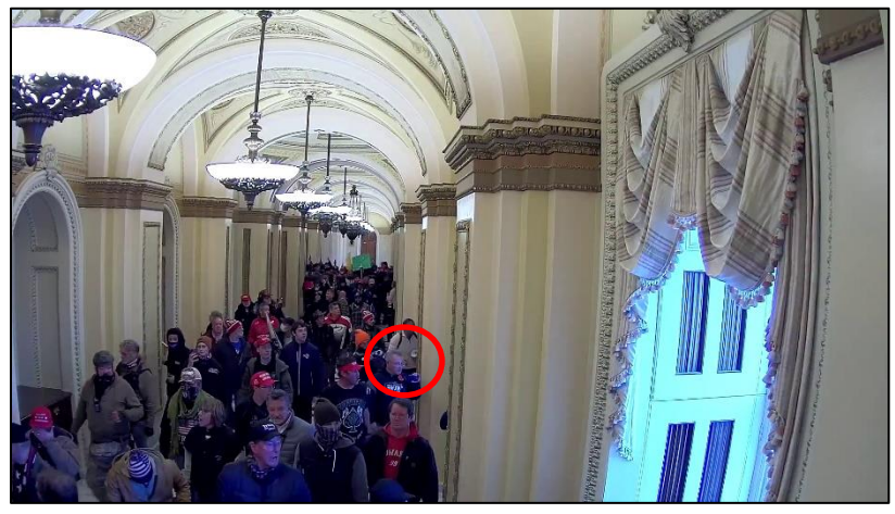
Figure 9 – USC CCTV (approximately 2:41 p.m.)