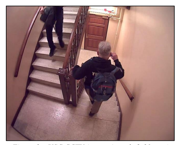
Figure 3 – USC CCTV (approximately 2:31 p.m.)