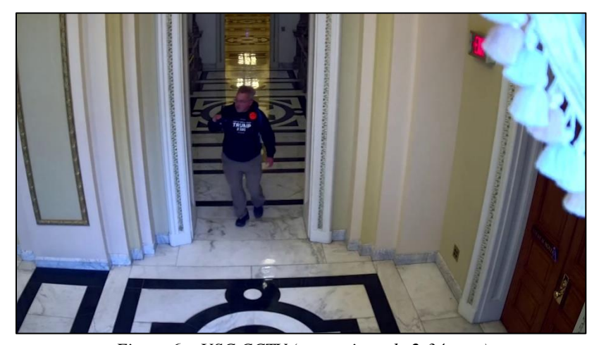
Figure 6 – USC CCTV (approximately 2:34 p.m.)