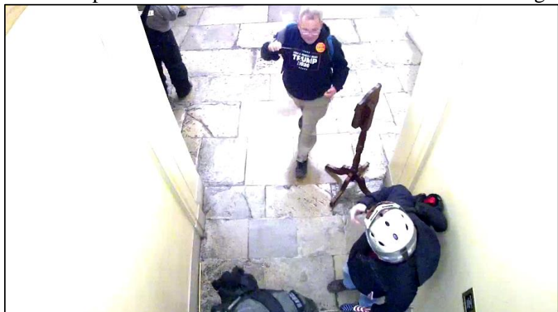
Figure 1 – USC CCTV (approximately 2:29 p.m.)

Below are screen captures taken from the aforementioned video footage.