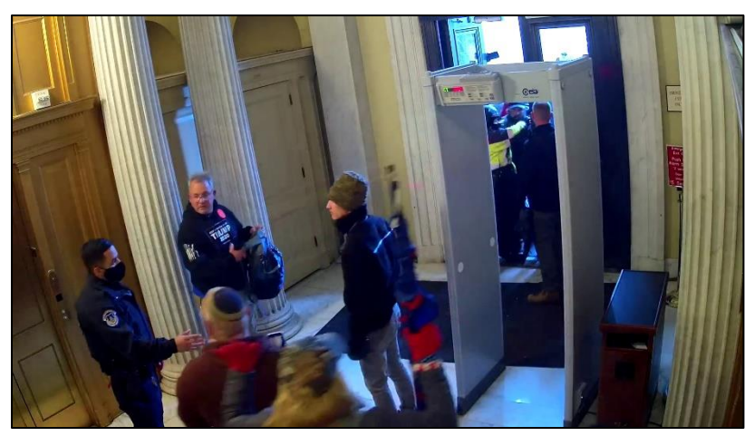
Figure 10 – USC CCTV (approximately 2:54 p.m.)