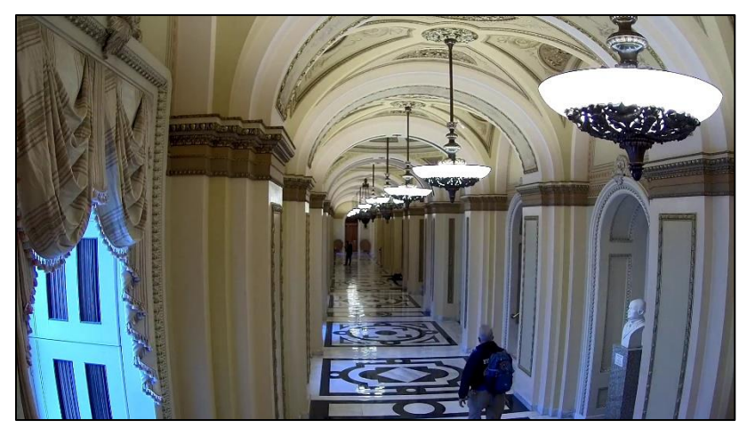
Figure 7 – USC CCTV (approximately 2:35 p.m.)