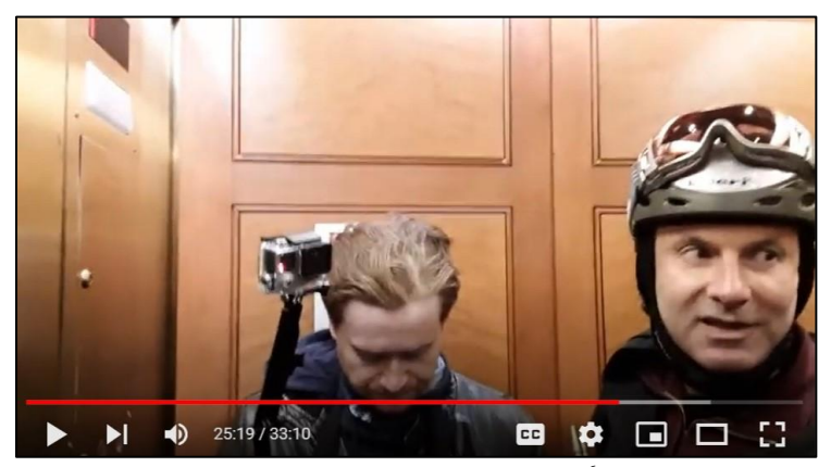
Figure 13 – YouTube<sup>6</sup>

Based on my review of the YouTube videos sent by paulko31@hotmail.com, referenced above, it appears that: (1) the YouTube videos match KOVACIK's route of travel described above and depicted in Figures 1- 12; and (2) the YouTube videos are consistent with the events as described by KOVACIK during the phone interview. For example, the recorder of the video boards an elevator in the Crypt approximately three minutes after entering the Capitol building with the same individuals depicted in Figure 2 above.