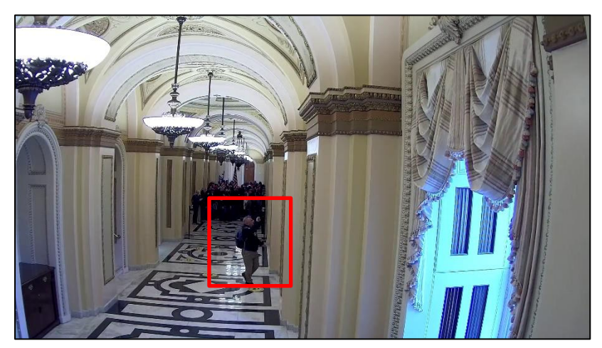
Figure 8 – USC CCTV (approximately 2:41 p.m.)