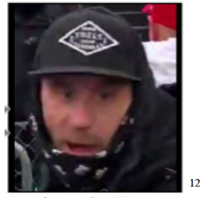
Photograph #49-AFO Figure 13.

On January 11, 2021, the FBI published a "Be On The Lookout" (BOLO) flyer with the following image: