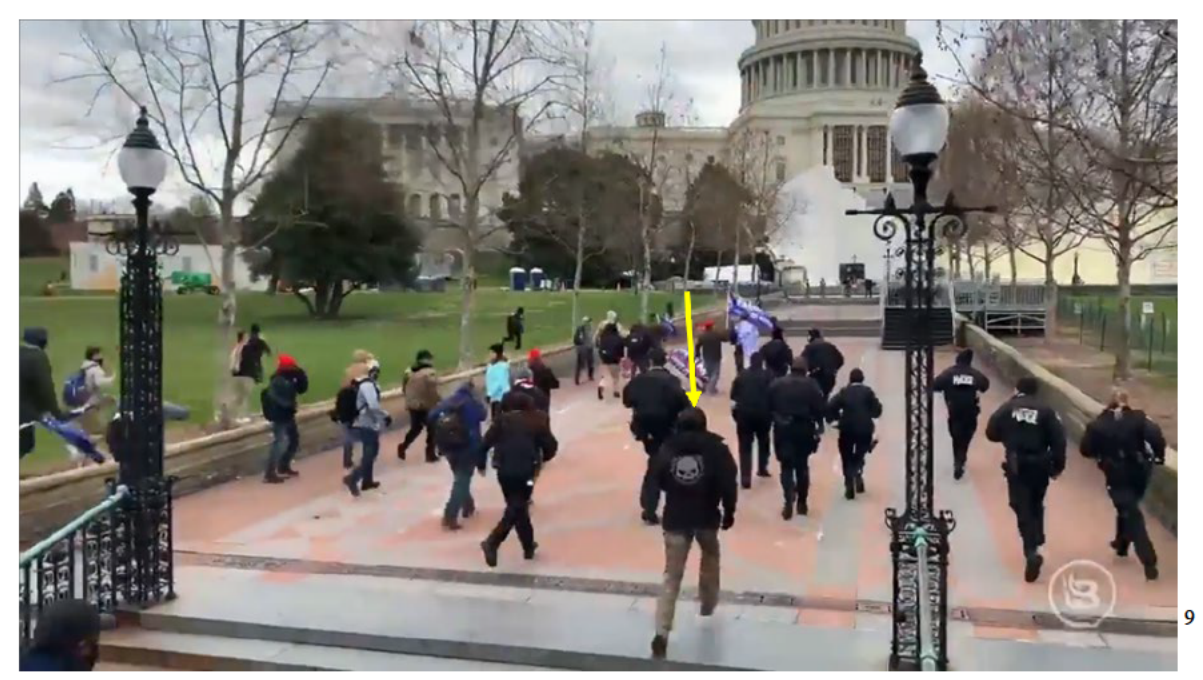
Figure 10. JOHNSON advancing past the barricaded police line toward the U.S. Capitol.

After dismantling and knocking over the line of metal barricades, JOHNSON can be seen running up the steps and further onto the restricted grounds, in the direction of the U.S. Capitol building. (Figure 10.)