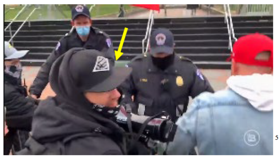
Figure 6. JOHNSON asking an unknown individual in the crowd to hold his backpack.

As others in the crowd begin pushing and pulling on the barricades, JOHNSON turns around, says "Hold my backpack," and proceeds to pass his backpack and megaphone to an unknown individual off camera, as if to prepare for a physical altercation. When JOHNSON turns around, he can be seen wearing a black flat billed hat with a white diamond-shaped logo.