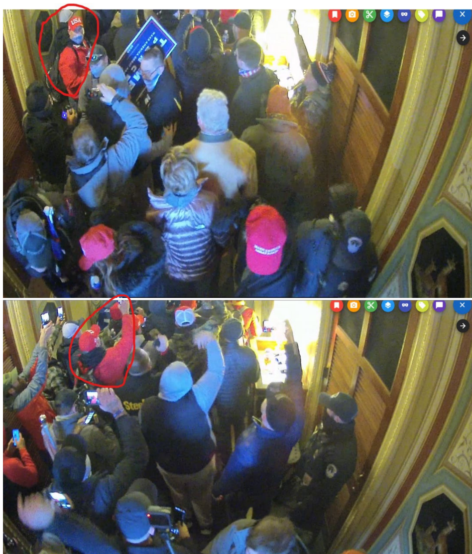
Images 4 and 5