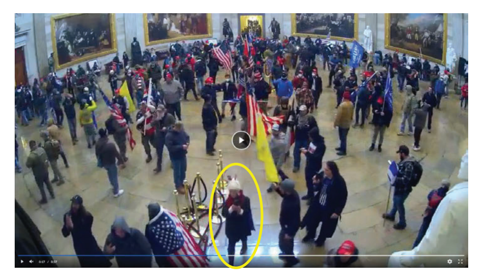
She briefly left the Rotunda for a few minutes, returning at 2:50 p.m.: