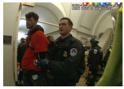
1654 HQOB 02 South Door Prisoner Process 01/06/2021 23:53:34