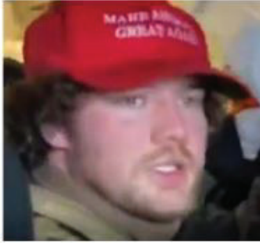
Photograph #147 - AFO