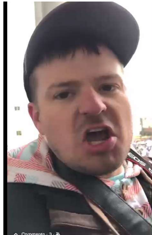
Figure (2) – Screenshot from Video