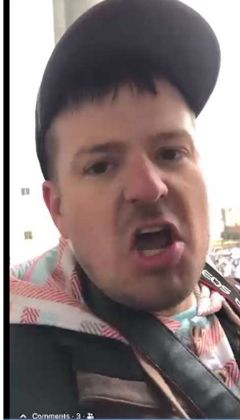
Figure (9) – ZINK During Door Breach

The third, and final, video segment was recorded at 3:28 p.m. on January 6, 2021. During that segment ZINK proclaimed: “You wanted to see what it’s become? We’re in the doors!” Towards the end of the segment, ZINK turned the video to capture an unknown subject breaching one of the windows at the U.S. Capitol. Screenshots of these videos can be found in Figure (10) and (11).