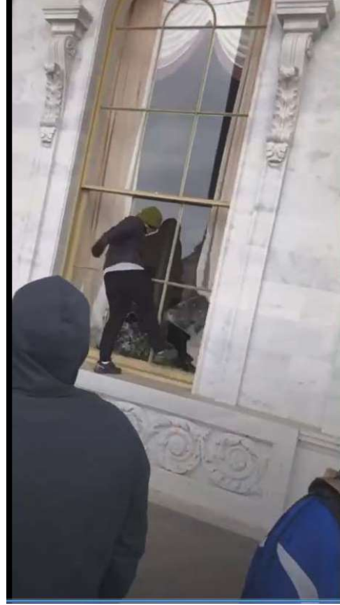
Figure (11) – Breaking Windows

On or about January 22, 2021, Magistrate Judge G. Michael Harvey of the U.S. District Court for the District of Columbia approved of a search warrant of ZINK’s Facebook account (“Facebook Account”) and Instagram Account (“Instagram Account”). A review of the returns confirmed ZINK’s presence in the Capitol.