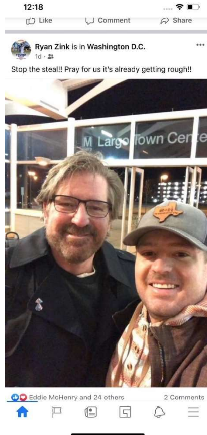
Figure (3) – Screenshot provided by CS-1

On or about January 7, 2021, the FBI telephonically interviewed CS-1. CS-1 provided the names of three individuals that had recently attended the protest in Washington, D.C. on January 6, 2021. One of the individuals was identified as ZINK. CS-1 stated that he/she followed the individuals on social media as the event took place. CS-1 provided a Facebook screen shot of ZINK shown as Figure (3).