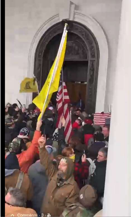
Figure (8) – Attempt to Breach Capitol Door