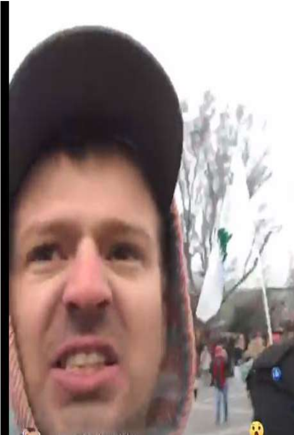
Figure (6) - Picture of ZINK at Protest