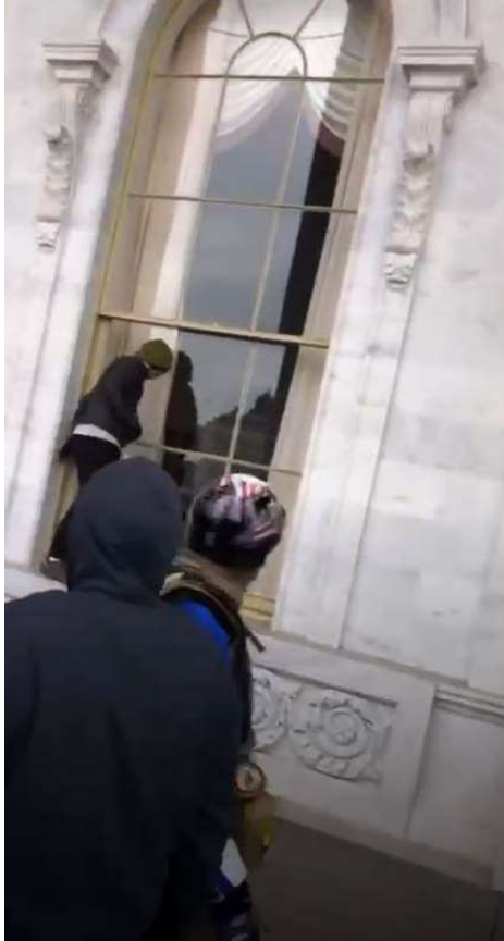
Figure (10) – Breaking Windows