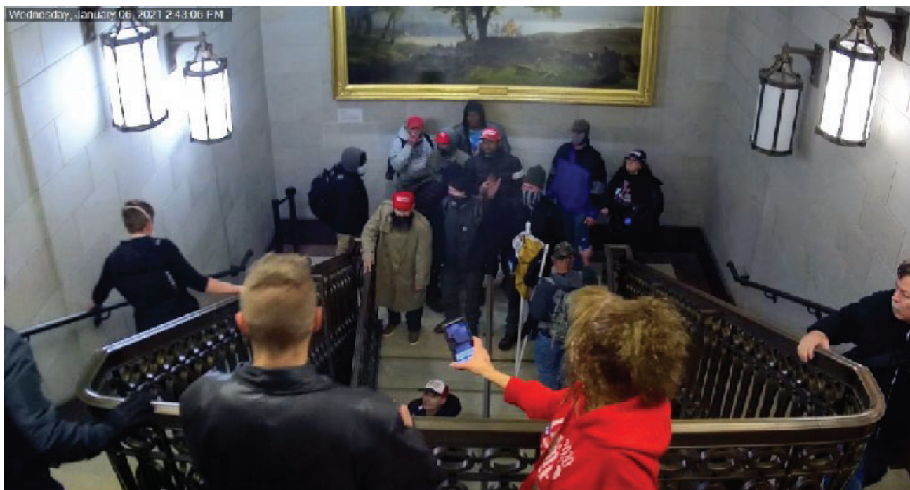
16. As depicted in images above, the woman has a jacket tied around her waist, a cross-