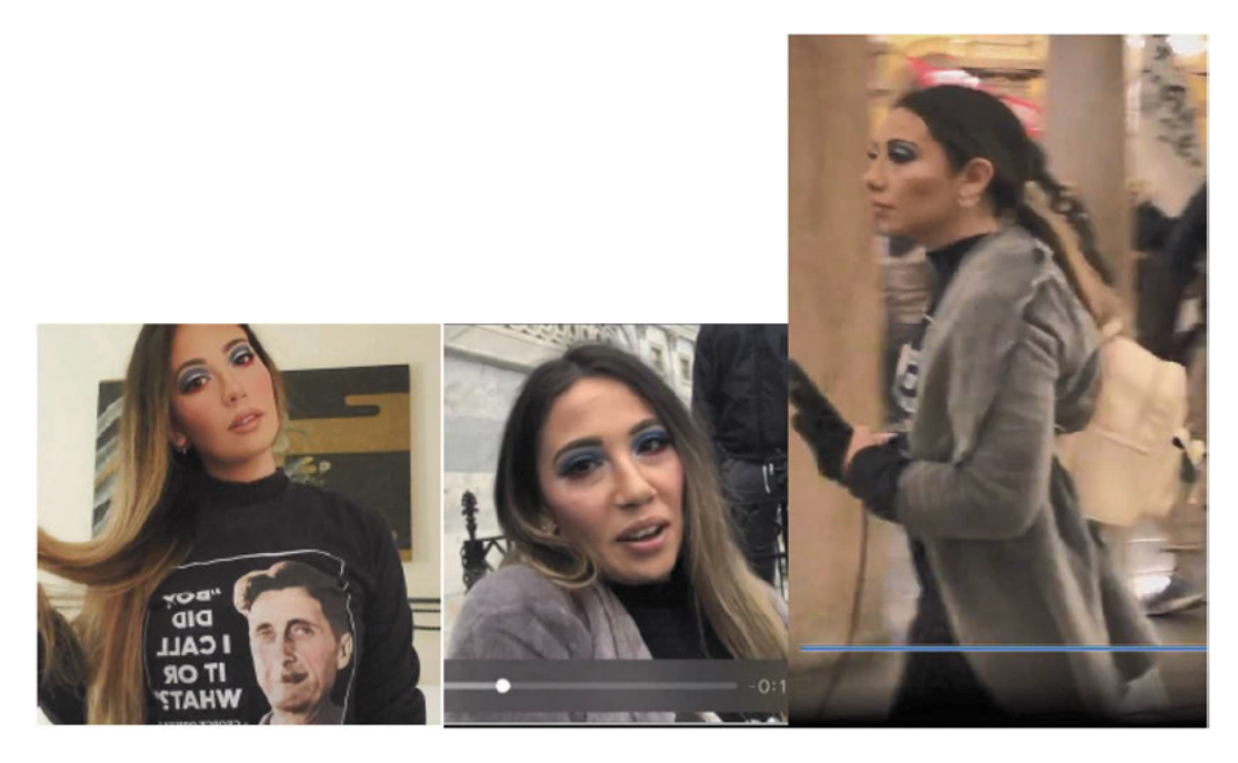
Screenshots 7, 8, and 9—Three screenshots that your affiant showed the defendant. The screenshots show (from left to right) an individual with a distinctive t-shirt depicting George Orwell, an individual seated in front of what appears to be the U.S. Capitol, and an individual inside of what appears to be the Capitol Crypt. The defendant identified the individual in each of those screenshots as herself.

During the non-custodial interview, your affiant showed the defendant the three screenshots shown below. The defendant identified the individual in each of the pictures as herself.