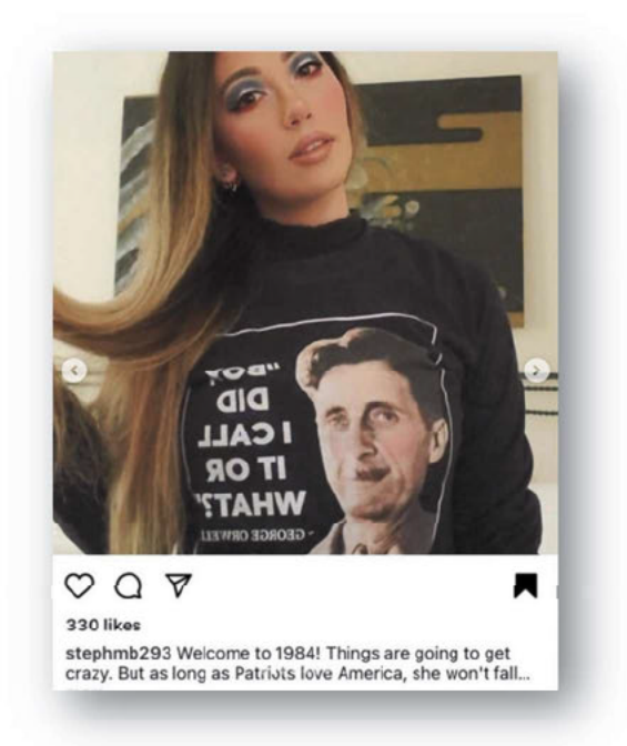
Screenshot 6—A screenshot of a post to the defendant's Instagram account from January 8, 2021, showing the defendant wearing the same black shirt that she wore while inside the Capitol on January 6, 2021. The shirt features a photo of George Orwell and attributes to him the quote: BOY DID I CALL IT OR WHAT?