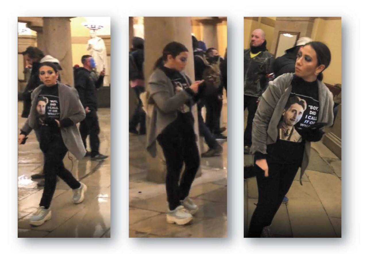
Screenshots 2, 3, and 4—Screenshots taken from open source videos that show (from left to right) the defendant walking through the Capitol Crypt; the defendant using her cellphone inside the Capitol Crypt; and the defendant standing inside of the Capitol using her cellphone, all on January 6, 2021.

meters, Google assigns a "maps display radius" of ten meters to the location data point. Finally, Google reports that its "maps display radius" reflects the actual location of the covered device approximately 68% of the time. In this case, Google location data shows that a device associated with telephone number 714-470-5495 was inside the Capitol on January 6, 2021 between 2:52:01 PM (EST) and 4:08:52 PM (EST).