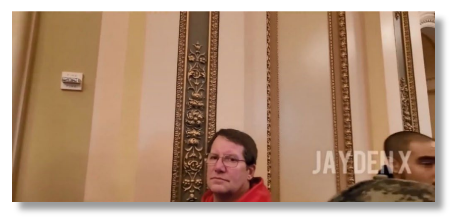
(Figure 1: Frame captured from Jayden X video, clip time 27:49, approximately 2:38 p.m.)

On or about January 7, 2021, an individual posted a video titled "The Insurrection of The United States Capitol" to YouTube under the username Jayden X. The video, which is no longer available on YouTube, <sup>1</sup> depicts, among other things, a large crowd climbing stairs leading to the Upper West Terrace of the U.S. Capitol, individuals entering the Capitol building through the Senate Wing Doors, and crowds walking through the Capitol hallways. The video captures several clashes between individuals and law enforcement, including the fatal shooting of Ashli Babbitt outside the Speaker's Lobby, adjacent to the House chambers. In the minutes leading up to this shooting, the video shows rioters attempting to breach the door to the House Chamber. The camera then pans to individuals standing in the hallway just outside the House Chamber and captures an individual wearing glasses and a red hooded sweatshirt at approximately 27:49. (Figure 1).