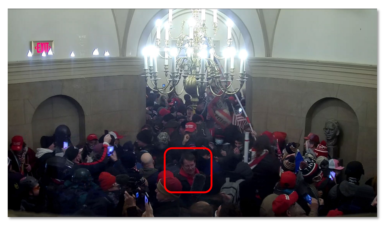
(Figure 6: CCTV of Memorial Door)