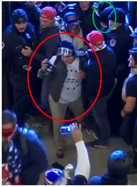
(entering approximately 3:02 P.M.)