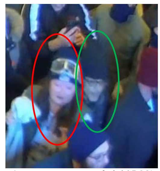
(exiting at approximately 3:16 P.M.)