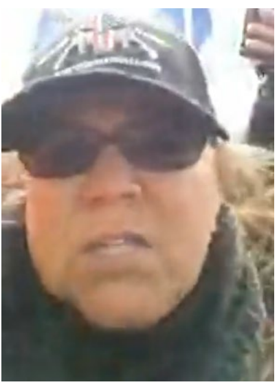
(while stating, "we are about to breach Congress")