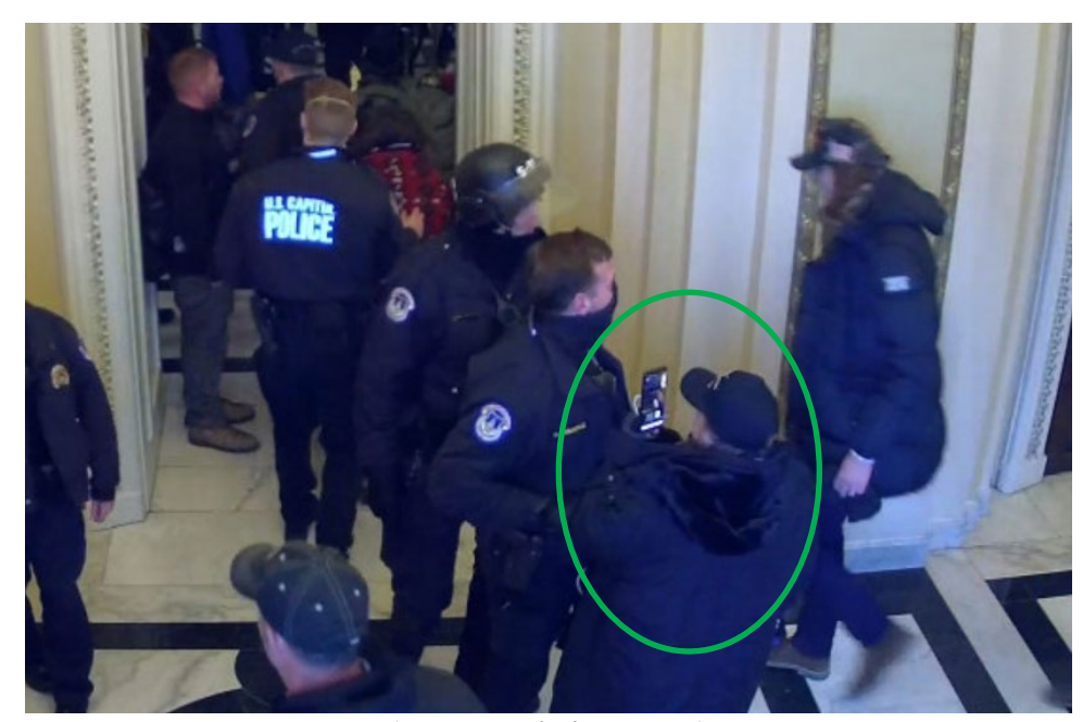
( Gray circled in green )