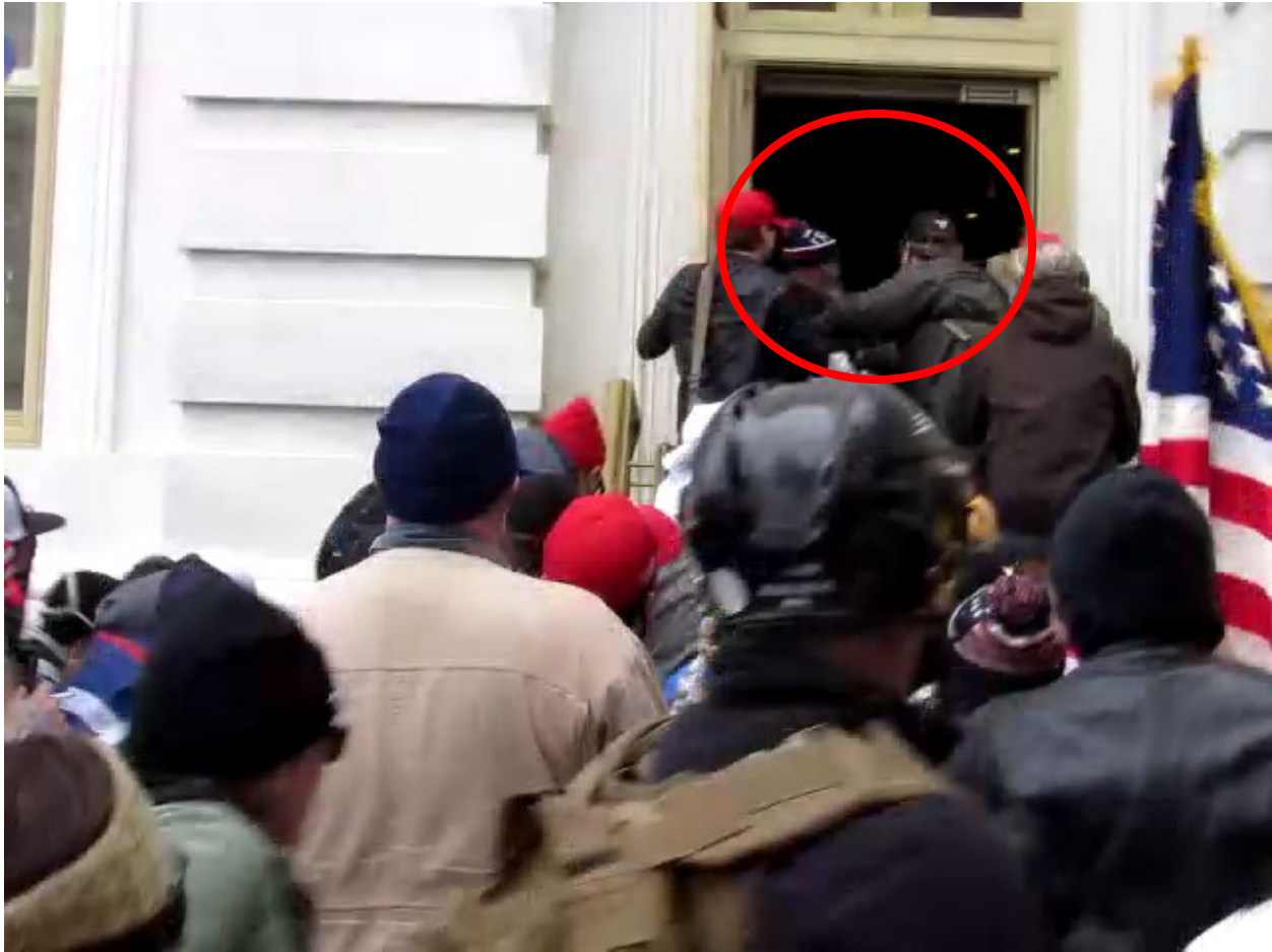
Image 6 from Williams Video Exhibit 3 (Red circle showing red hat and red, white and blue ski cap with man with long beard)

Defendants Crase and Williams immediately moved to enter the same door approximately 50 seconds after the door was violently breached, and the initial rioters pushed through the officers who tried to stop the rioters from gaining entry. Once inside, other rioters kicked open the door to the Parliamentarian’s Office, which at that point had been evacuated.