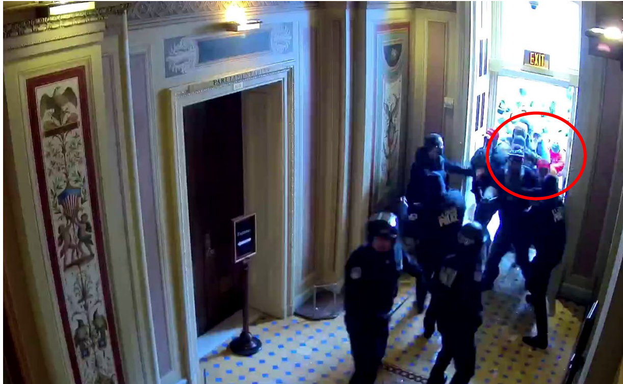
Image 11- Entry of Rioters Into Hallway- (note red circle- man with red, white and blue ski cap with long beard, and man in red cap behind him)