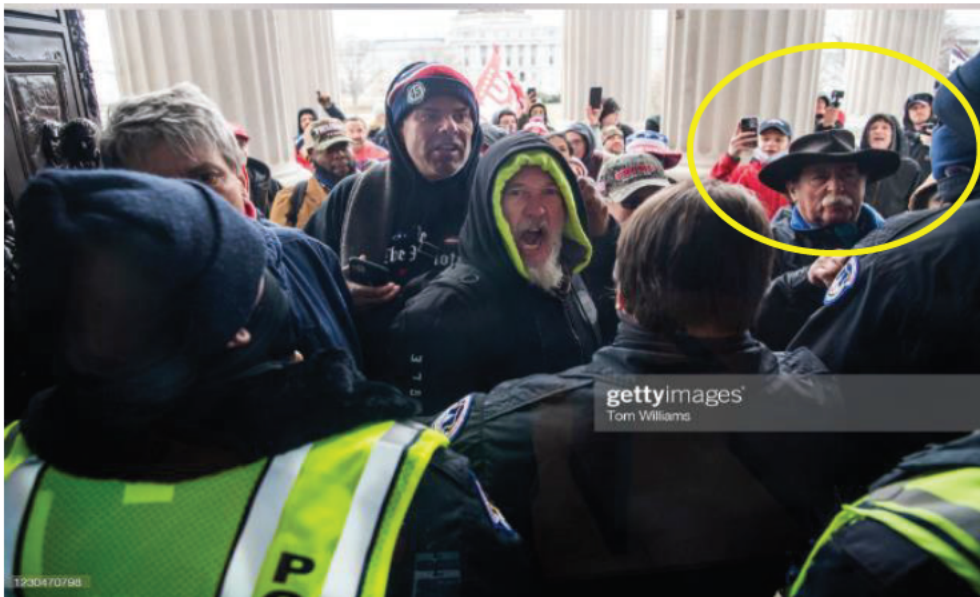
Picture 2. In front of a line of United States Capitol Police Officers