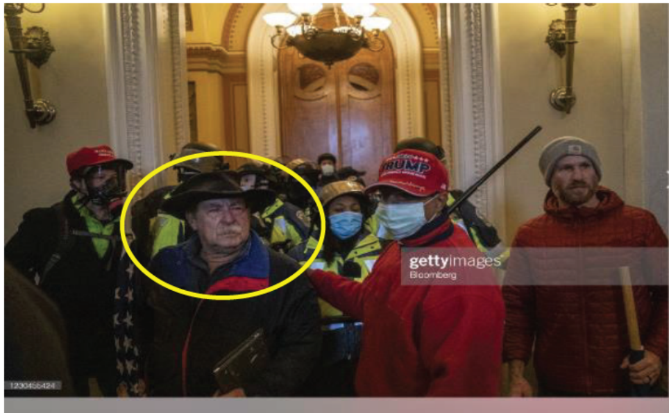
Picture 3. Appearing to be inside of the Capitol Building.

Based on a review of publicly available video, your affiant has located further footage that captures the same individual depicted in the images above (including the unique jacket with red and blue trim, the brimmed hat, and the laptop/tablet under his arm). 2 A screen grab from that video includes the following image: